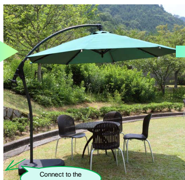
Connect to the pump with provided tube.