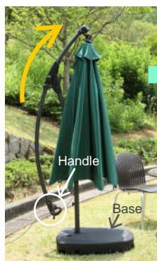
Push the handle and extend the arm fully.